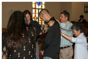
Members of Westview pray for their New Youth Leader